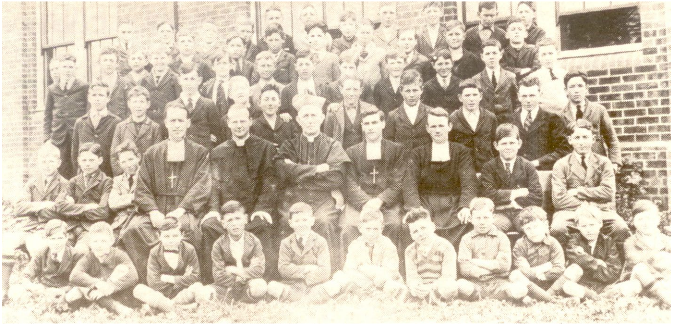
The first class in Johnson Street - 1926