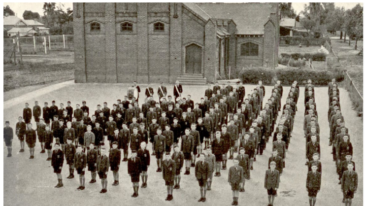
Students lined up to start the morning