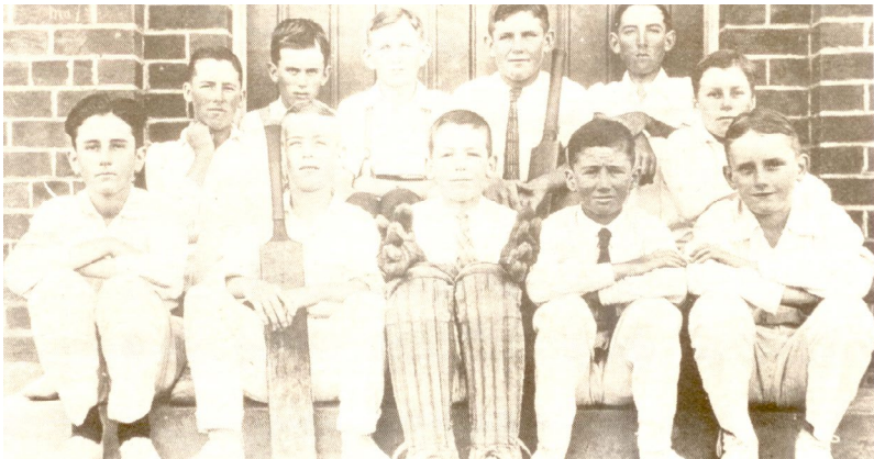
First cricket team - 1926