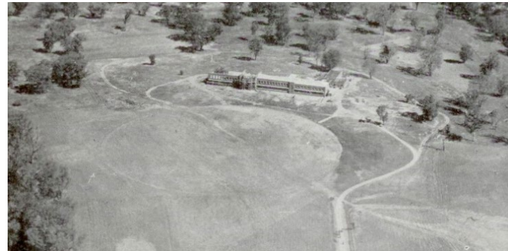
Red Bend site